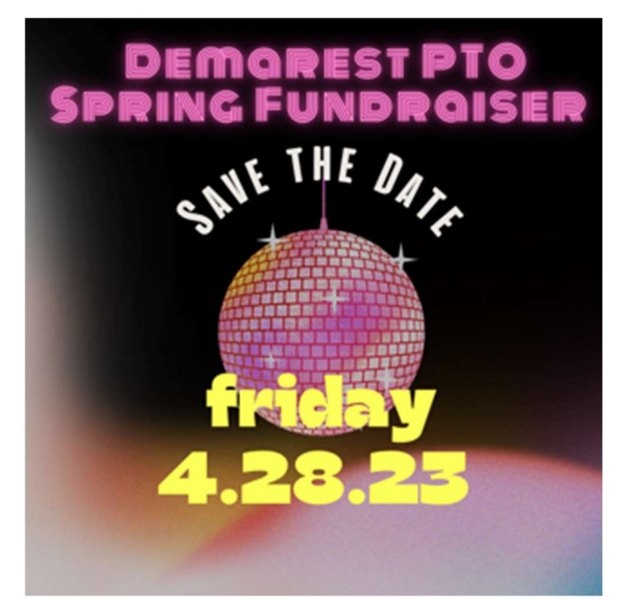
Save the Date! Our Spring Fundraiser Gala will be held on Friday, April 28, 2023 at the Montammy Golf Club!